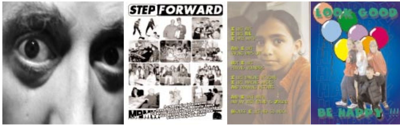
from left to right: Strink Rapped 2, Step Forward, BBC Arts Week and the Happy Project. Below Northam 521 digital mural