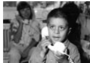
Maytree High Scope Display

MPMW's Apple Mac computer suite has been much in demand over the last year. We have offered support to people wanting to take the plunge into new photographic technologies as well as for the unemployed wanting new skills to get back to work. We need to make fresh investment in this area as most of our equipment is entering the end of its useful life.