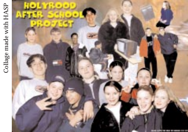
Collage made with HASP